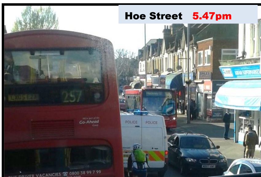
A police van and cyclist struggle to find a way through the traffic.